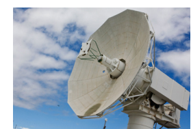
Radar / Commercial